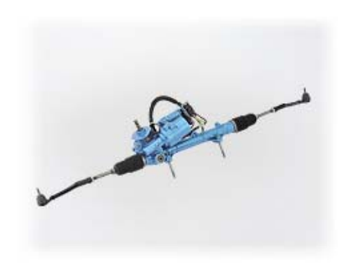
Pinion type EPS