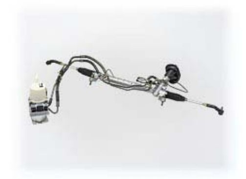
Dual pinion type EPS