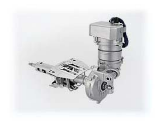
Column type EPS